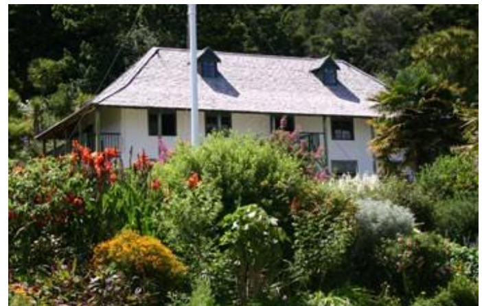
Pompallier Mission Station in Kororareka (Russell)