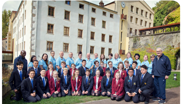
St John's & Sacred Heart Girls College tour party

The group visited and performed to four Marist schools in the region and presented two public concerts. It was an enriching experience for students, staff and accompanying parents alike. The trip was based around their pilgrimage to Notre Dame de l'Hermitage and of significance was the visit to the chapel of Saint Marcellin Champagnat, the founding Father of the Marist Institute.