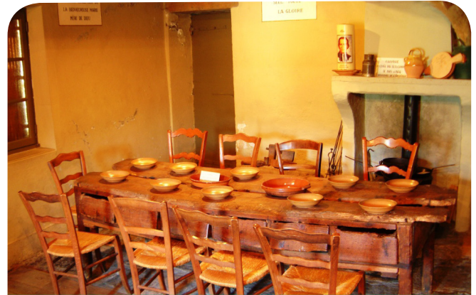
The La Valla table

Take a look at this table today venerated by all Marists when they enter the very room where the name of Marist came into being 200 years ago. Visitors from around the world have chipped away at its edges in the hope of capturing the pure gift of Brotherhood so as to share with others in other lands.